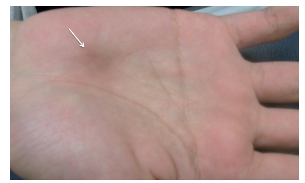
Fig. 1. Clinical presentation. A tender, mobile subcutaneous nodule on the right palm ( arrow ).

Clinical examination revealed a tender, mobile subcutaneous nodule 12 \times 12 mm on the right palm near the antithenar eminence. Slight, poorly demarcated pigmentation was observed on the surface of the nodule ( Fig. 1 ). Ultrasonography confirmed that there was no blood flow inside the tumour. Surgical excision was performed under the clinical diagnosis of recurrent ganglion cyst. The excised specimen revealed the proliferation of atypical cells with vesicular nuclei and mild myxoid areas ( Fig. 2 A), mixed with prominent inflammatory cell infiltrates of lymphocytes and plasma cells (Fig. 2B). Large cells with atypia were also noted, part of which resembled Reed–Sternberg cells (Fig. 2C). Immunohistochemically, these atypical cells were