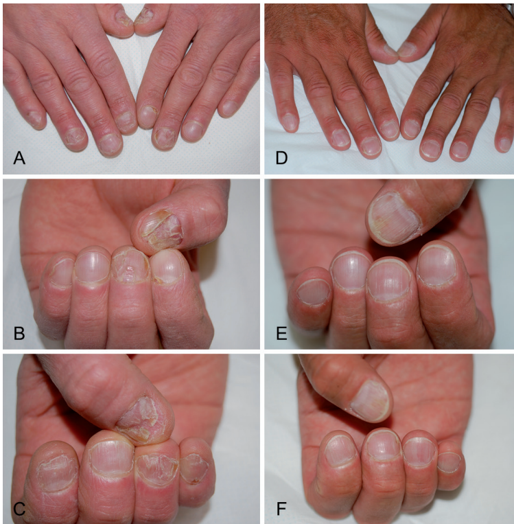
Fig. 1. Clinical manifestation of nail psoriasis, with crumbling and onycholysis (A–C) before and (D–F) after 24 weeks of treatment with secukinumab.

in the dorsal nail plate, which are easily detachable, leaving the pits on the surface of the nail plate (8). Psoriatic pits are usually large, and deep, with irregular shape and distribution, and are typically found on the fingernails. While pitting can also be observed in other diseases, such as alopecia areata and eczema, in these conditions it has different characteristics. Red spots on the lunulae (mottled lunulae) are considered to be non-specific manifestations of nail matrix psoriasis, as they can also be present in other diseases, such as nail lichen planus and eczema. When nail matrix involvement is severe, the nail plate can become fragile and deformed, which can lead to crumbling.