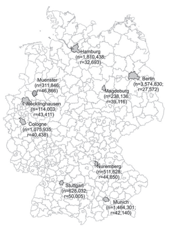
Fig. 2. Google search volume of skin cancer-related terms in 9 German cities from July 2014 to June 2018. n : number of inhabitants; r: number of search queries per 100,000 inhabitants.

The category "skin cancer in general" had the highest search volume, with 1,499,490 queries. Within this category, most keywords referred to "identifying skin cancer" (n=233, Table I). Of these keywords, almost half focused on images of skin cancer (n=102), which