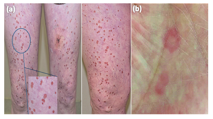
Fig. 2. (a) Lower extremities with multiple bean-sized red flat papules. (b) Annular macules on the palm.