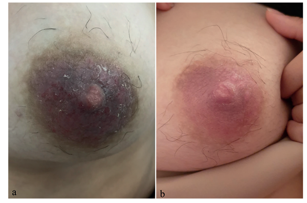
Fig. 1. (a) Eczematous, pruritic, brownish plaque on the left nipple and areola of a 17-year-old girl. (b) Complete regression after 6 months of 0.05% topical tretinoin.

A 6-mm punch biopsy revealed a spongiotic and markedly acanthotic epidermis with proliferation of pale keratinocytes easily distinguished from normal ones. The epidermal ridges were elongated in a psoriasiform manner and fused, the granular layer was almost absent and the stratum corneum showed parakeratosis and serous exudate (Fig. 2a). Clear cells stained positively with the routine periodicacid-Schiff, indicating the presence of glycogen (Fig. 2b). Intraepidermal portions of the annexes were normal. The underlying dermal papillae showed dilated capillaries and a scarce inflammatory cell infiltrate with predominantly lymphocytes and some granulocytes.