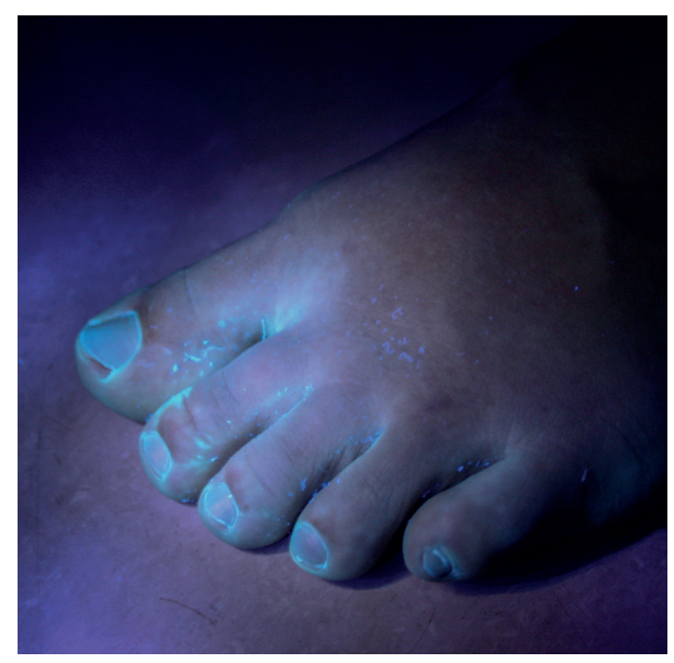
Fig. 3. Fluorescent material on dorsal aspects of the feet (especially interdigitally).

Due to her reports of hypohidrosis, a sweat provocation test with following sweat pH measurements (Jenway pH meter, Model 3510, Cole-Parmer, Staffordshire, UK) were performed. The patient performed 15 min of indoor cycling and 15 min of treadmill running. During this exercise she produced some sweat. However, this was less than was subjectively expected. Her scalp, hair, anterior and dorsal trunk, palms, and feet were surprisingly dry. pH measurements of sweat were considered normal (mean/ min-max; 5.6/5.1–6.5). No wheals were induced during exercise.