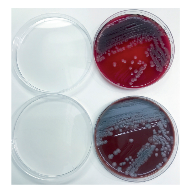
Fig. 4. Bacillus cereus: 2 isolates; one with a blue tint and one without.

Both adults were treated with oral erythromycin, 250 mg 3 times a day, and topical clindamycin 2 times a day for 10 days. As the female patient still had a slight discolouration on her feet, she continued same topical treatment for 7 days. Complete remission of blue discolouration was achieved in both patients, and it did not return during an observation time of 6 months.