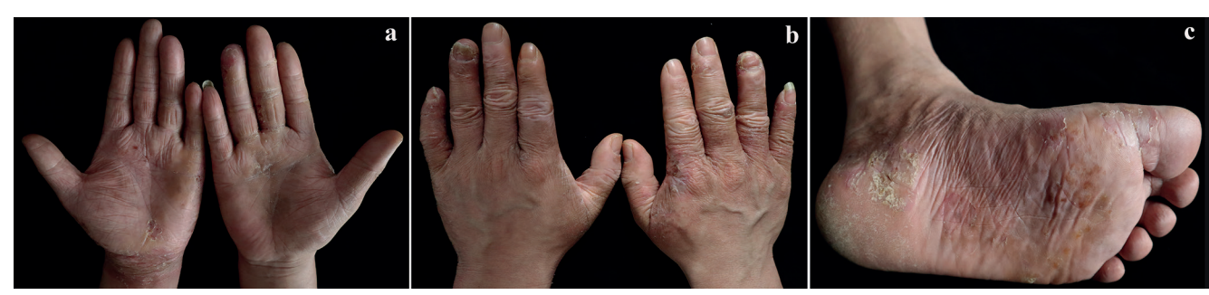
Fig. 2. Combination of narrow-band ultraviolet B (UVB) phototherapy and injection of interferon-a1/b markedly improved skin lesions and nail changes after 12 months.