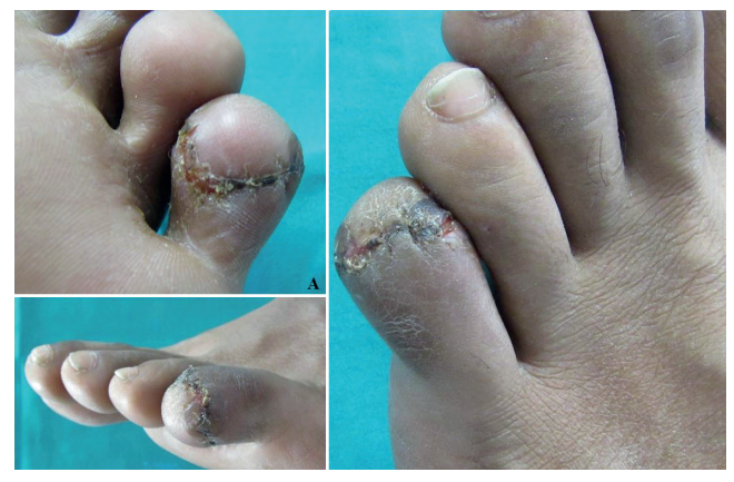
Fig. 3. Follow-up at 3 weeks, after V-Y flap reconstruction.

Once again, this case highlights the importance of dermoscopy and the identification of a vascular pattern