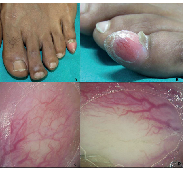
Fig. 1. (A, B) Nodular bullet-like pink lesion with keratotic plug at the end of the left little toe. (C, D) Diffuse monomorphic vascular pattern characterized by arborizing vessels with high variability in length and thickness on diffuse blushing background (non-polarized digital dermoscopy, magnification ×20).

A 45-year-old North African man referred to us with a bullet-like nodule, which was smooth, firm and pink, that had appeared one year previously on his left little toe (Fig. 1A, B). At first it was asymptomatic, but in the last 3 months the lesion had begun growing, completely involving the nail