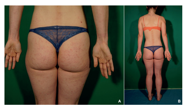
Fig. 1. Disseminated inflammatory papular lesions on the buttocks and volar forearms, on the entire surface of the lower limbs and a few lesions located on the lower back, which appeared 3 days after the first dose of human papillomavirus (HPV) vaccine.

A diagnosis of PLEVA was made based on the clinical features and histopathological data. The patient was given a course of oral azithromycin, 250 mg daily for 7 days, and mild corticosteroid ointment was applied for 1 month. Subsequently, it was decided to continue therapy with 5 cycles of azithromycin (1 dose of 250 mg