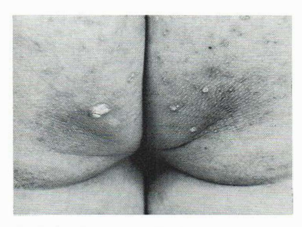
Fig. 6. Superficial disseminated eruptive form of Porokeratosis Mibelli.