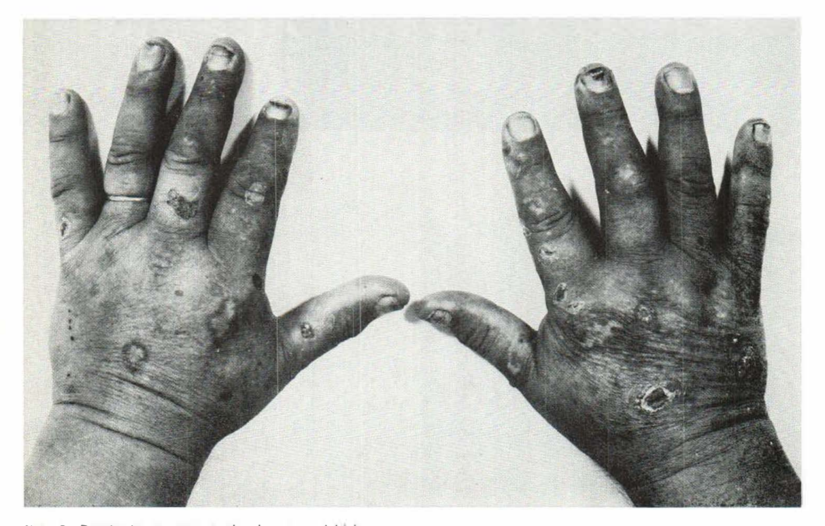
Fig. 8. Porphyria cutanea tarda due to colchicine. Acta Dermatovener (Stockholm) 51