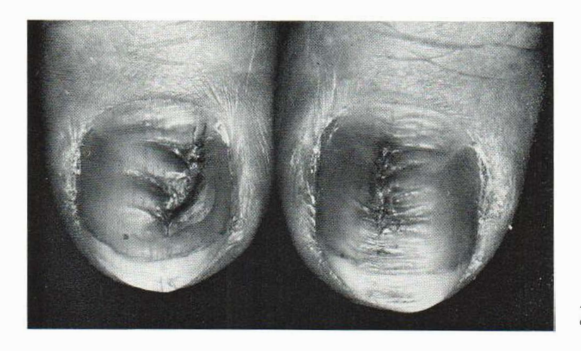
Fig. 5. Dystrophia unguis mediana canaliformis.