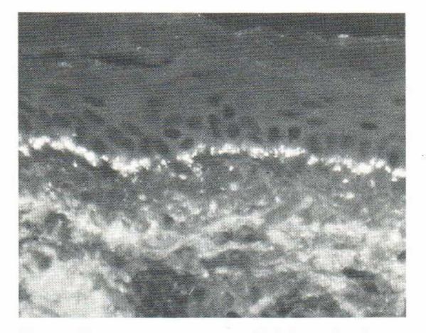
Fig. 3. Granular-linear pattern of lgA at the dermoepidermal junction.

with homogeneous-linear deposition of IgA along the BMZ. This pattern of deposition and type of immunoglobulin turned out to be remarkably stable. Approximately six biopsies were taken from each patient during \frac{1}{2} -5 years, but in none of these was either a granular-linear pattern of IgA or a papillary one seen. In addition IgA was the only class of immunoglobulin found in positive biopsies. Circulating antibodies against the BMZ were not found. However, normal human skin was used as substrate in only 4 of the patients. By using this substrate, circulating BMZ antibodies of IgA class have earlier been reported in 3 of 7 cases with linear IgA deposits (15, 23).