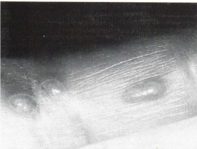
Fig. 1. Hyperkeratotic pellucid atypical varicella-zoster lesions on a finger.

The varicella-zoster antigen ELISA test was positive but the herpes