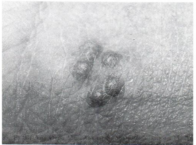
Fig. 2. A cluster of hyperkeratotic papules on the wrist.