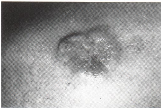
Fig. 1. Clinical aspect of tumour on hospital admission.

In this report, we describe the histological and immunohistochemical features of a rare case of a subcutaneous leiomyosarcoma in an elderly man.